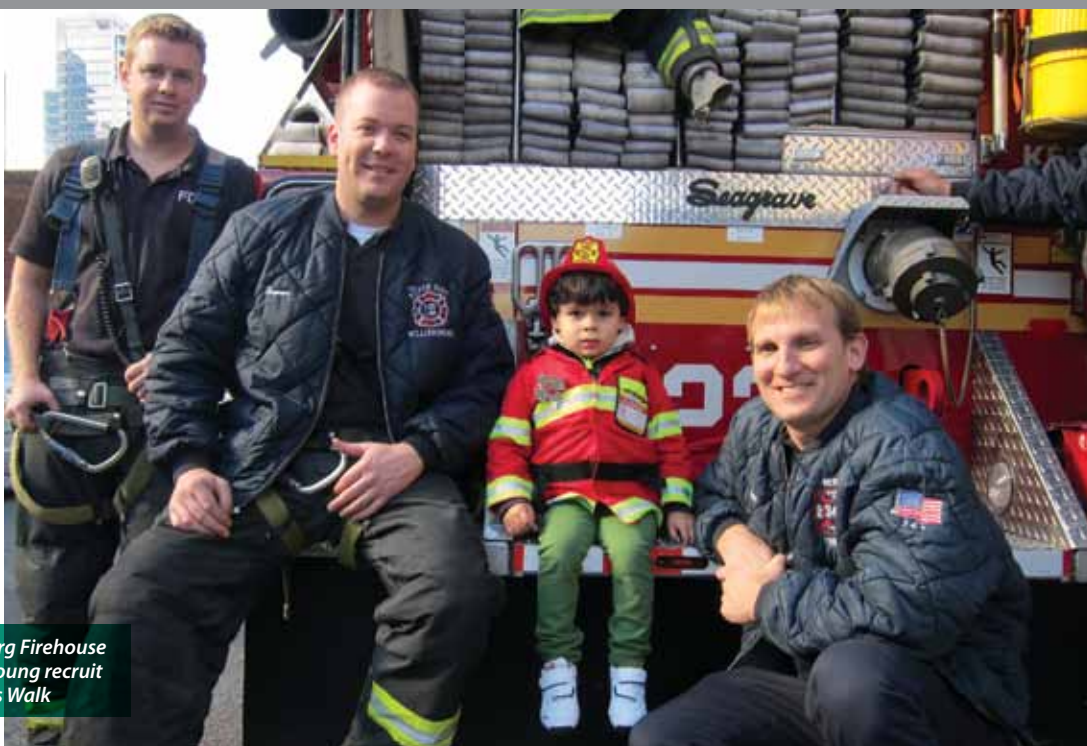
Firemen from Williamsburg Firehouse Engine 221 pose with a young recruit at the 2010 Witches Walk

On October 31st, 2010 the Northside Merchants Association hosted the Witches Walk kids costume parade and activity fair. An entire block of N. 6th Street was shut down to traffic for the event, which included a kid's drum circle, air-brush tattoos, a photo booth, and an obstacle course. In addition to the hundreds of local families that came out for the Witches Walk, we were also paid a visit by a NYPD fire truck, much to the delight of several young firemen in training!