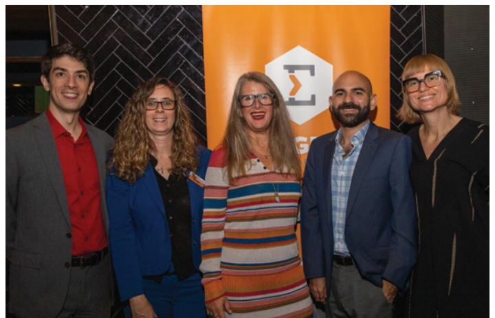
Evergreen's 40th Anniversary gala