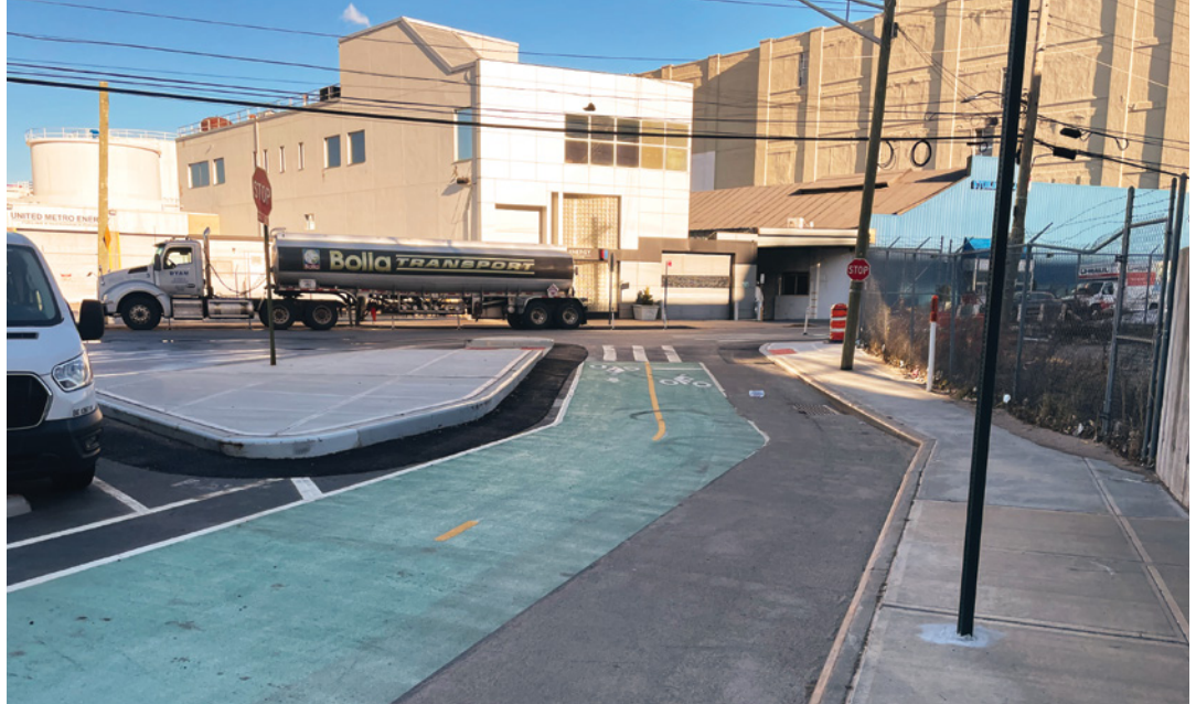
Street improvements on Kingsland Avenue

Evergreen spends quite a lot of time and energy advocating on behalf of local firms. Much of the work we do benefits both industrial businesses as well as the community at large, such as our participation in public planning on transportation issues like truck routes and bike lanes. Evergreen staff also represents the organization on the boards of the Urban Manufacturing Alliance, Association for Neighborhood Housing Development, Community Board 1 and the Newtown Creek Alliance.